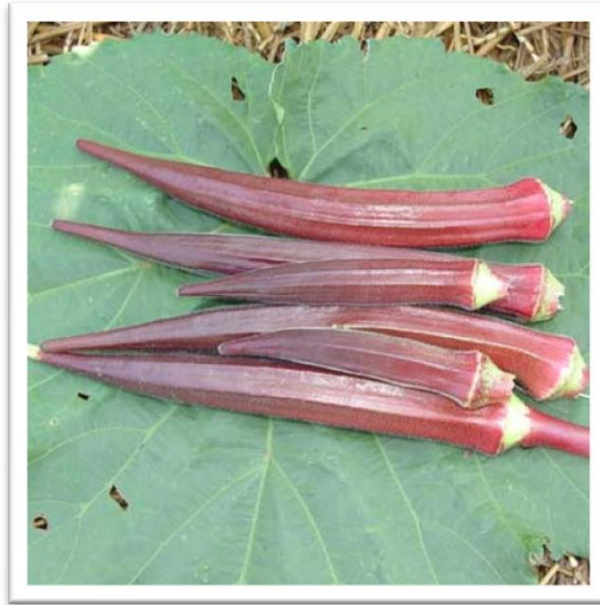
Bowling Red Okra