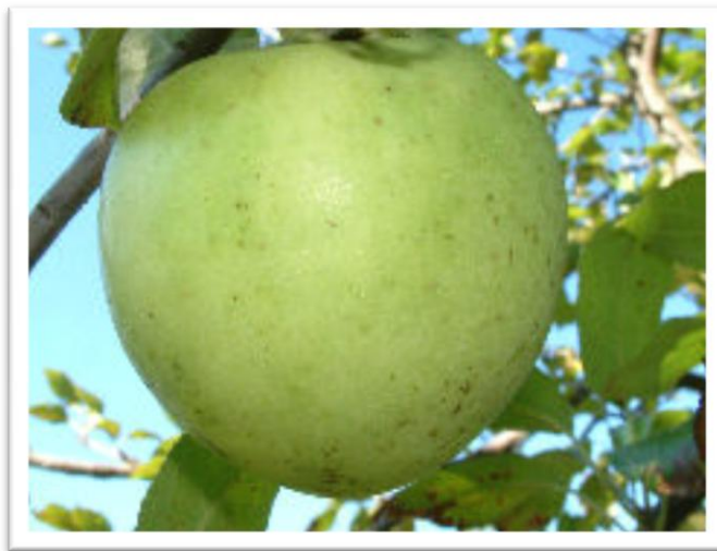
Virginia Greening Tomato