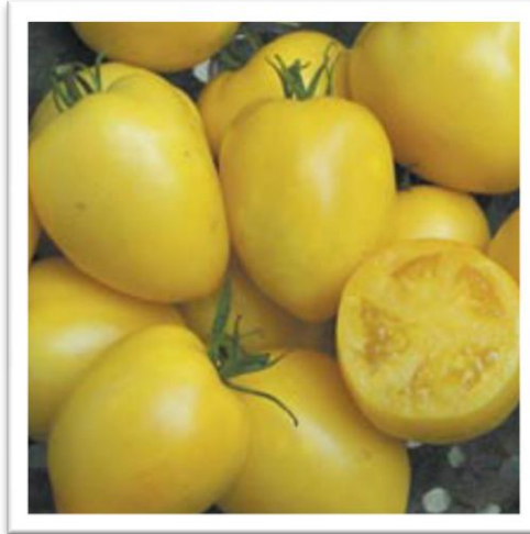
Power's Heirloom Tomato.