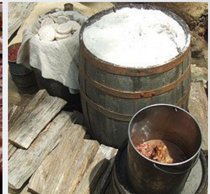
Staples: Hard tack biscuits, cush cush, salted pork