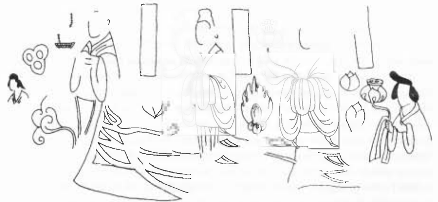
Figure 3.3 Drawings of female donors in Chinese-style dress, Western Qin, c. 420. Binglingsi Cave 169, north wall.

The multiethnic character of patrons is also indicated at Dunhuang. On the west wall of Cave 268, which the Dunhuang Research Institute dates to the Northern Liang period or the first quarter of the fifth century, six donor images