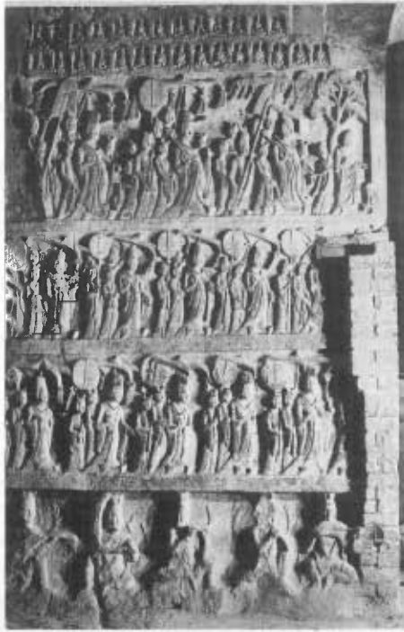
Figure 3.9 Royal donors (Emperor Xuanwu? at top right), Northern Wei, first quarter of sixth century. Gongxian Cave 1, south wall. Limestone.