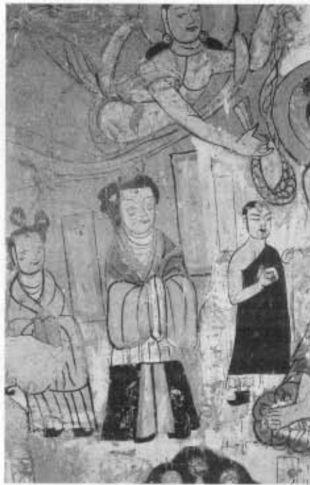
Figure 3.2 Images of monk, two female donors, and attendant, Western Qin, c. 420. Binglingsi Cave 169, north wall. Wall mural.

Other figures painted here probably include Chinese priests. The lay devotees are shown in both nomadic and Chinese-style costumes. One group (Figure 3.2) shows a monk followed by three women on the proper right side of a Buddha triad (that is, the left side of the triad from the viewer's perspective). The monk, shown with stubble on his face, wears a monastic robe that bares his right arm and covers a lower garment. He wears short boots, a hint that he might be of foreign origin. In his left hand he holds a lamp, in his right hand a small object