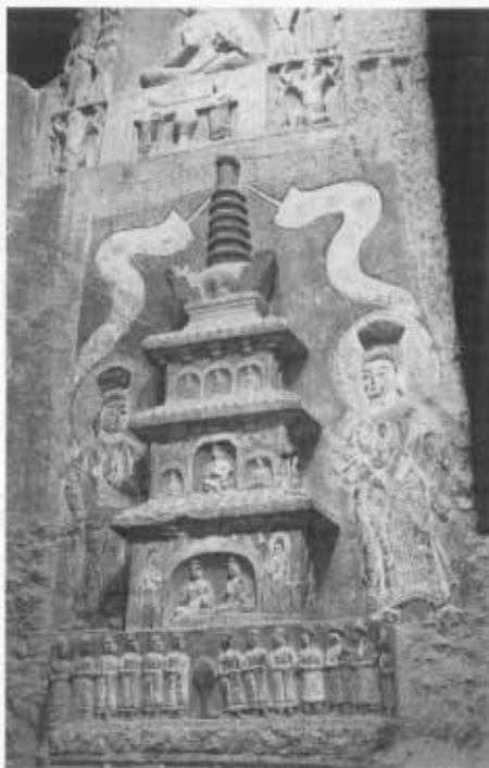
Figure 3.6 Donor images on pedestal of relief carving of a pagoda, Northern Wei, third quarter of fifth century. Yungang Cave 11, south wall. Sandstone with pigments.

One of the many examples is a three-story pagoda carved in relief on the south wall of Cave 11 (Figure 3.6). 52 The pagoda itself has recessed niches