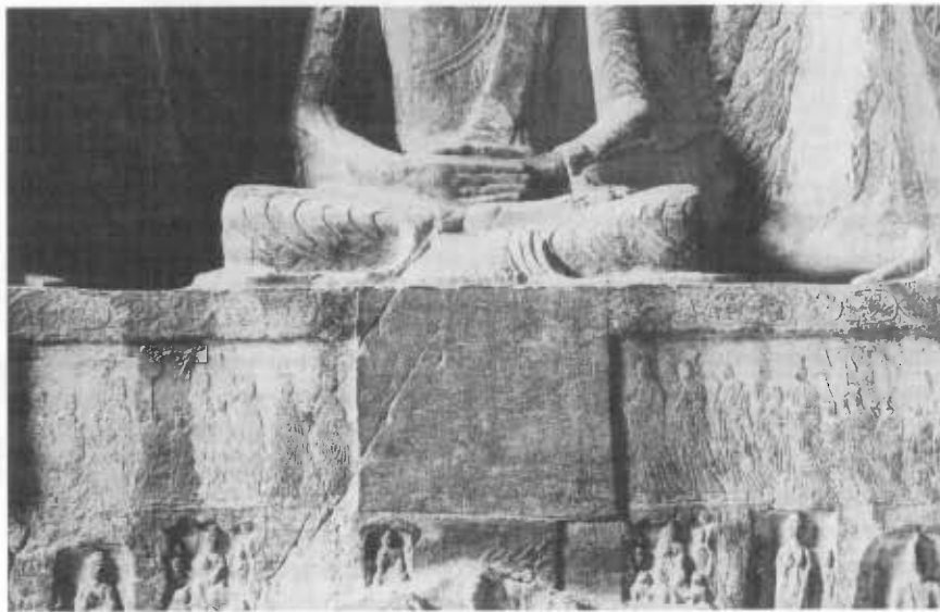
Figure 3.8 Images of imperial donors (Emperor Xiaowen on right, Prince of Beihai and his mother on left) engraved below Buddha image dedicated by monk Fasheng, Northern Wei, dedicated 503. Longmen, Guyang Cave, south wall. Limestone.

Second, among this early group of images at the Guyang Cave, donor images are not always shown, and when they are, the donors are portrayed wearing the Chinese dress of long, flowing robes and headdresses. The change in costume results from Emperor Xiaowen's edict to adopt Chinese dress. A particularly beautiful example is the panel of images beneath a Buddha image for Emperor Xiaowen (d. 499), dedicated by the priest Fasheng, the Prince of Beihai (Beihai wang), and his mother in 503 (Figure 3.8). 71 The Prince of Beihai, Yuan Xiang,