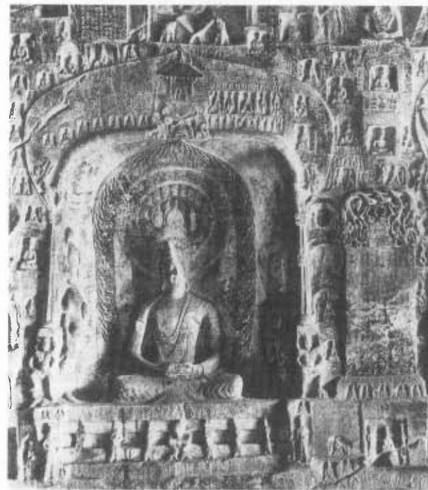
Figure 3.7 Seated Buddha image dedicated by Yang Dayen, inscription engraved on a stele carved in relief to the right of the niche, Northern Wei, c. 500–3. Longmen, Guyang Cave, north wall. Limestone.

These detailed inscriptions thus provide us not only with information that supplements dynastic records, but also offer a glimpse at a historical moment