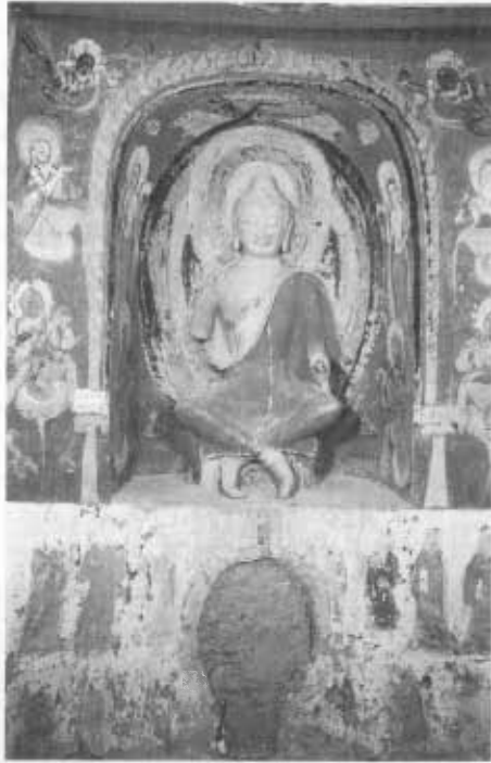
Figure 3.4 Donor images depicted below Maitreya Buddha image in recessed niche, Northern Liang, early fifth century. Dunhuang Cave 268, west wall. Wall mural with pigments.