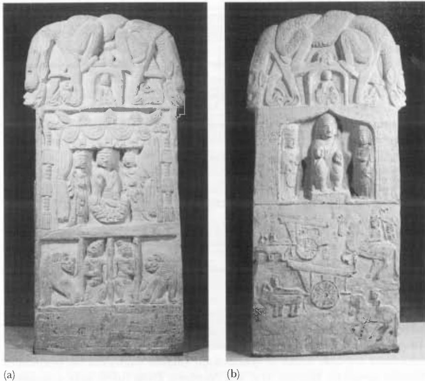
Figure 3.11 (a) Buddhist stele dedicated by Wang Lingwei and his family, Northern Zhou, dated 573. Stone. H. 90 cm, W. 39 cm. Gansu Provincial Museum. (b) Reverse side of Wang Lingwei stele in Figure 3.11a, with images of donors shown in lower half.